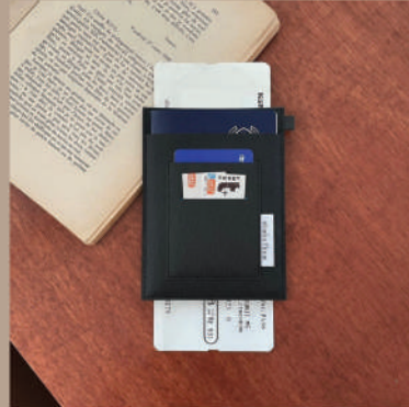
Paper leather Passport case