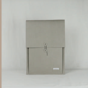
Paper leather Laptop pouch

We develop practical and differentiated designs using eco-friendly paper leather. Experience Studio Floue's sustainable products.