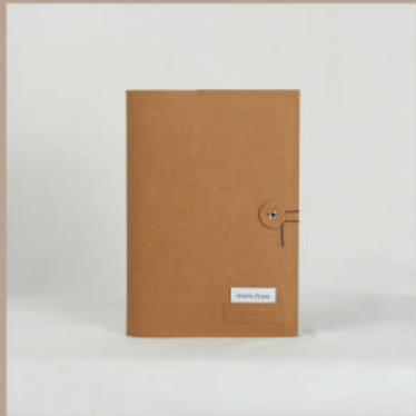
Paper leather Book cover