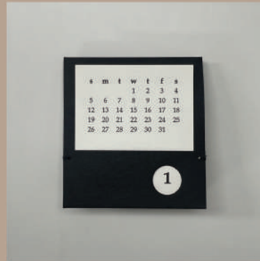
Paper leather Calendar

It is a sustainable product that can be used continuously by changing the inner surface.