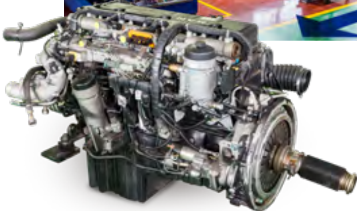
▲ Remanufactured product of Diesel Engine(MAN COMMON RAIL)