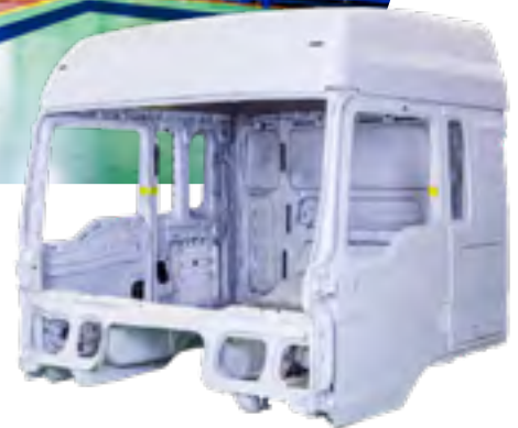
▲ Cab remanufactured product of MAN Tractor